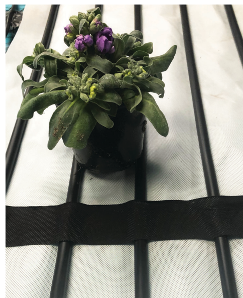
Roll 'N Grow MTX