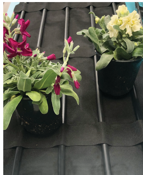
Roll 'N Grow MCX