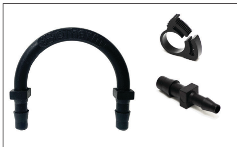
Roll 'N Grow MTX