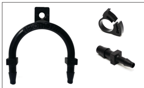
Roll 'N Grow MCX