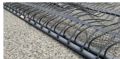
Roll 'N Grow manifold

Choose from 16 x 16 mm mesh or weed barrier mat (black or white).